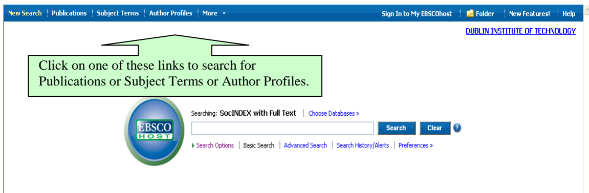
Fig. 1.7 How to search for Publications, Subject Terms and Author Profiles.

You can also obtain information relating to authors in the social sciences by clicking on the Author Profile link at the top of the page and either entering the name of the author in the search box or browsing through the alphabetical list of authors. This will enable you to discover biographical information relating to the author, his/her area of expertise and academic/professional focus.